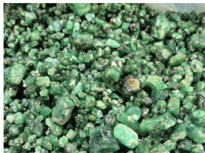
Picture is not actual size. The color of the item(s) and the color of the picture may be different.