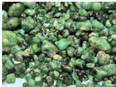
Picture is not actual size. The color of the item(s) and the color of the picture may be different.