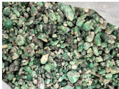
Picture is not actual size. The color of the item(s) and the color of the picture may be different.