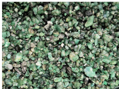
Picture is not actual size. The color of the item(s) and the color of the picture may be different.