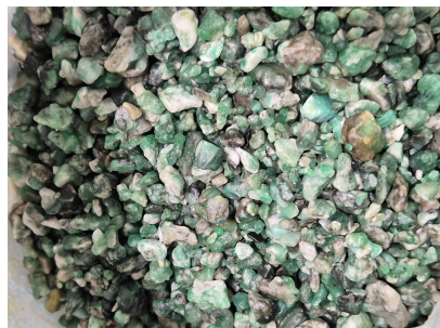
Picture is not actual size. The color of the item(s) and the color of the picture may be different.