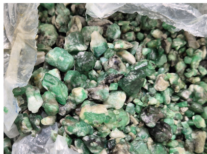
Picture is not actual size. The color of the item(s) and the color of the picture may be different.