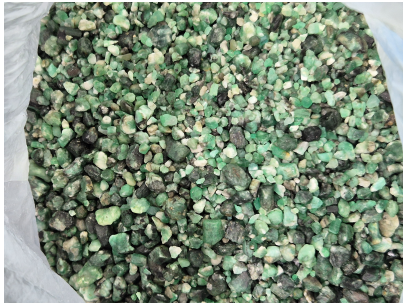
Picture is not actual size. The color of the item(s) and the color of the picture may be different.