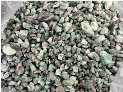
Picture is not actual size. The color of the item(s) and the color of the picture may be different.