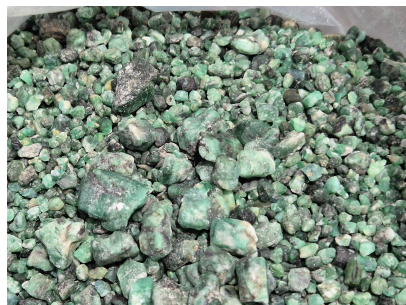
Picture is not actual size. The color of the item(s) and the color of the picture may be different.