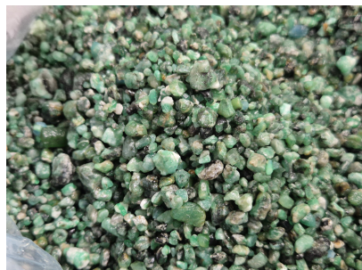
Picture is not actual size. The color of the item(s) and the color of the picture may be different.