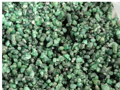
Picture is not actual size. The color of the item(s) and the color of the picture may be different.