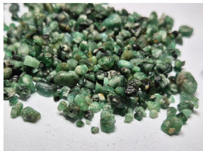
Picture is not actual size. The color of the item(s) and the color of the picture may be different.