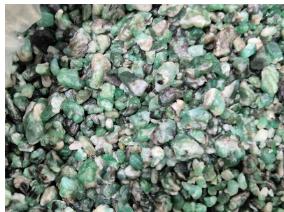
Picture is not actual size. The color of the item(s) and the color of the picture may be different.