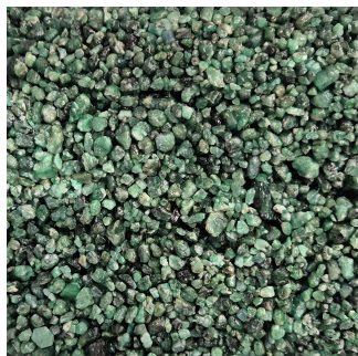
Picture is not actual size. The color of the item(s) and the color of the picture may be different.