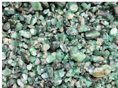
Picture is not actual size. The color of the item(s) and the color of the picture may be different.