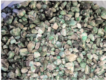
Picture is not actual size. The color of the item(s) and the color of the picture may be different.