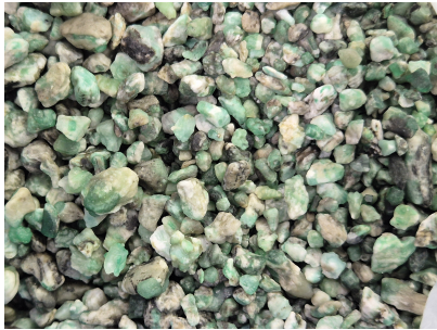
Picture is not actual size. The color of the item(s) and the color of the picture may be different.