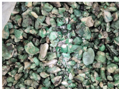
Picture is not actual size. The color of the item(s) and the color of the picture may be different.