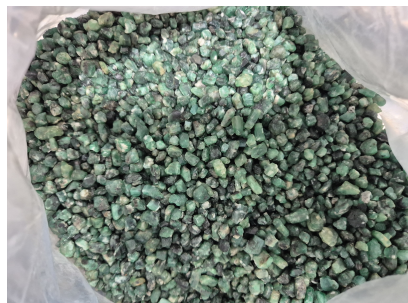
Picture is not actual size. The color of the item(s) and the color of the picture may be different.