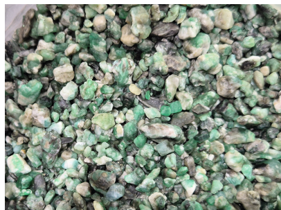
Picture is not actual size. The color of the item(s) and the color of the picture may be different.